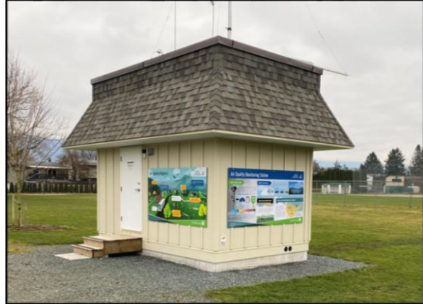
Figure 2. The FVRD's Air Quality Monitoring Station at Centennial Park in Agassiz (January, 2025)