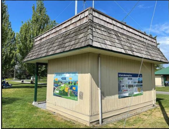
Figure 1. The FVRD's Air Quality Monitoring Station at Mill Lake Park, Abbotsford (May 2022).

The proposed Licence of Occupation for the air quality monitoring station in Agassiz is for a renewed 10-year term expiring February 28, 2035. Last year, this station was relocated from within the District of Kent's City Hall to Centennial Park (Figure 2). Similar to the Mill Lake station, this monitoring station also has educational signage about air quality.