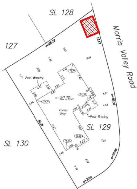
Figure 1. Existing shed location