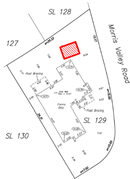
Figure 2. Proposed shed location