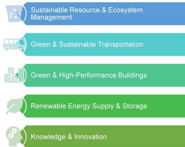
Figure 2: Framework for the Clean Economy in the Fraser Valley

For the purposes of this study, the clean economy in the FVRD can be grouped into the following five sectors: