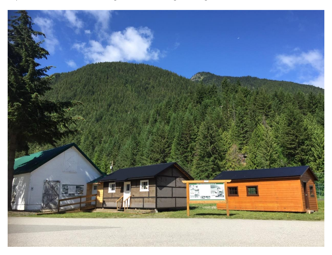
2nd shot is where I am planning on relocating the kindergarten schoolhouse. It will be located behind the main museum building but connected through a corridor from main museum building.

1st shot is how the museum look as of today. Replica Tashme shack and the original RCMP building to the right.