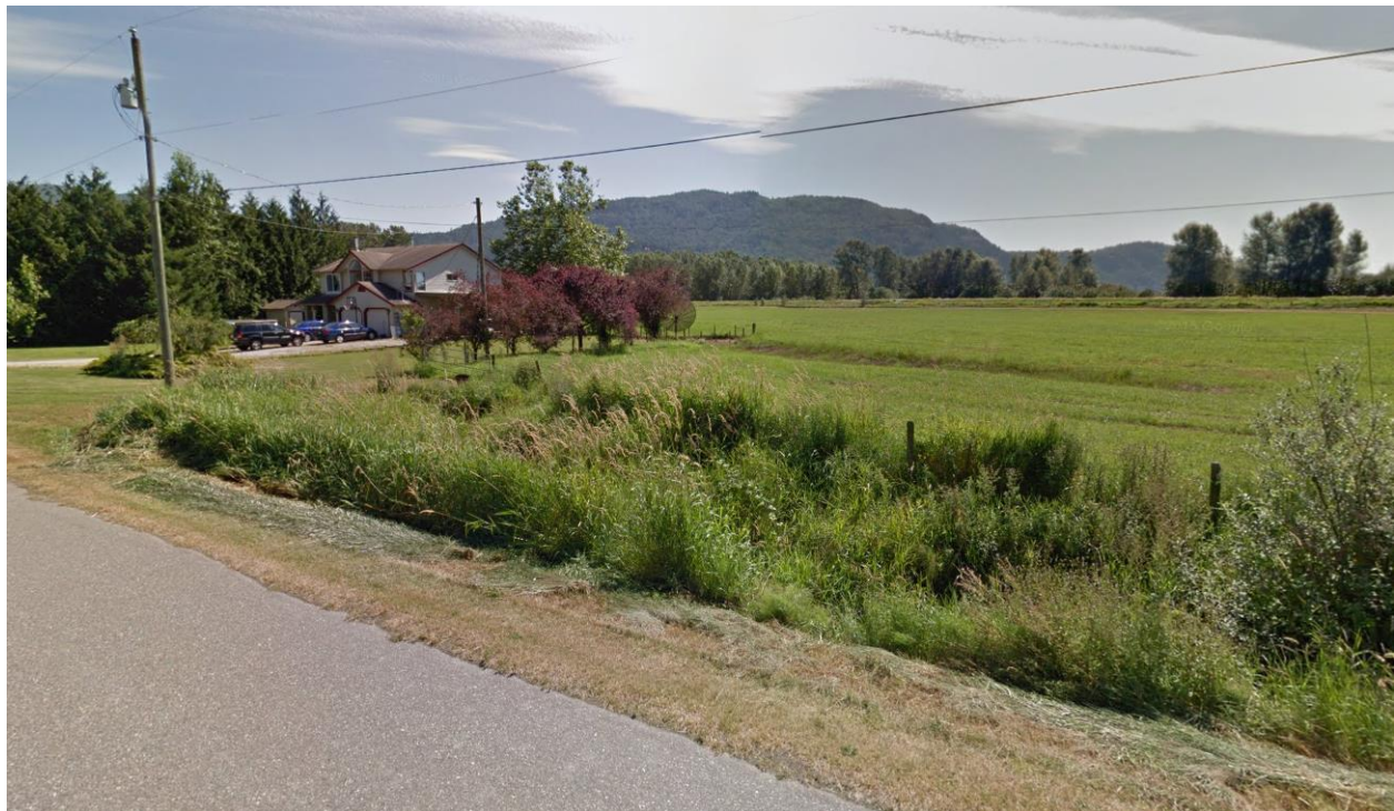
Figure 1: View of the subject property from Hyde Buker Road.

The applicants further state that the neighbours in their general vicinity are aware of their plans to place an accessory family residence on the property. According to the applicants, the neighbours are aware and supportive of their plan.