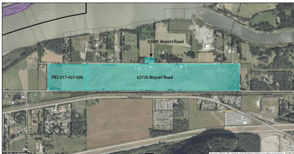
Figure 1. Land parcels at the Fraser Valley Regional Airport

Within these parcels (at the ends of the runway and adjacent to the runway, see figure 2 below) the Airpark has approximately 35 acres of agricultural land available for lease that cannot be used for other purposes. In November 2022, the Fraser Valley Regional District (FVRD) advertised a Notice of Disposition for available lease land. Lorenzetti Acres has proposed to lease 17 acres of the agricultural land for growing grass for making hay and/or silage at a cost of $300 per acre. The recommended agreement is for 5 years with an option to renew for an additional 5 years. There is interest in potentially taking on more agricultural land lease in the future, which the agreement would allow for.