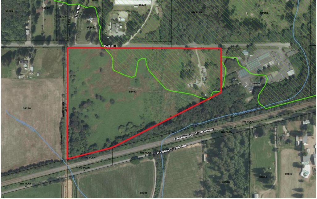
Figure 1: The hatched area shows the portion of property within DPA 1-G

Development Permit Area 2-G - Riparian Areas